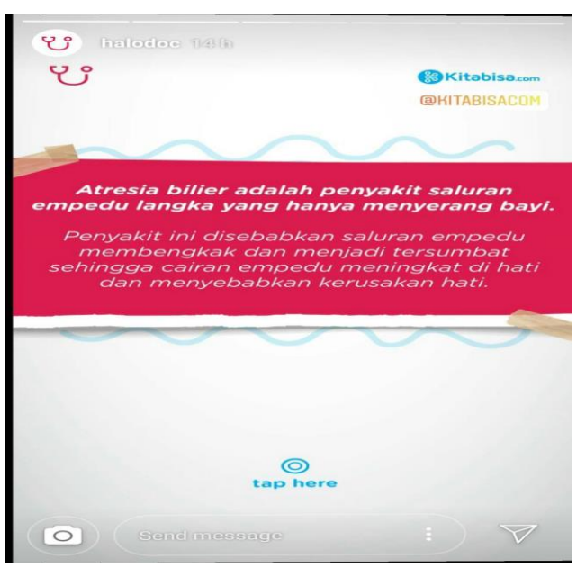
Figure 3. Instagram as a business and promotional media. This Figure was adopted from https://www.instagram.com/halodoc /stats?hl=en on 2019., on December 5, 2019

Based on the data above, it shows that there are 5 social media that are most often used by internet users. The data is taken from the website WebSindo. The 5 media most frequently used by internet users in Indonesia in 2019 is YouTube, WhatsApp, Facebook, Instagram, Line with the percantage of 88, 83, 81, 80, and 59%, respectively. From the statistics above, social media is needed by internet users. So, based on those needs, business activities that use social media as a forum for business start to emerge, especially social media Instagram as one of the most frequently used business platforms. Business is not only a non-profit business, but businesses in the health sector also use Instagram social media as a tool to promote their services (see Figure 3).