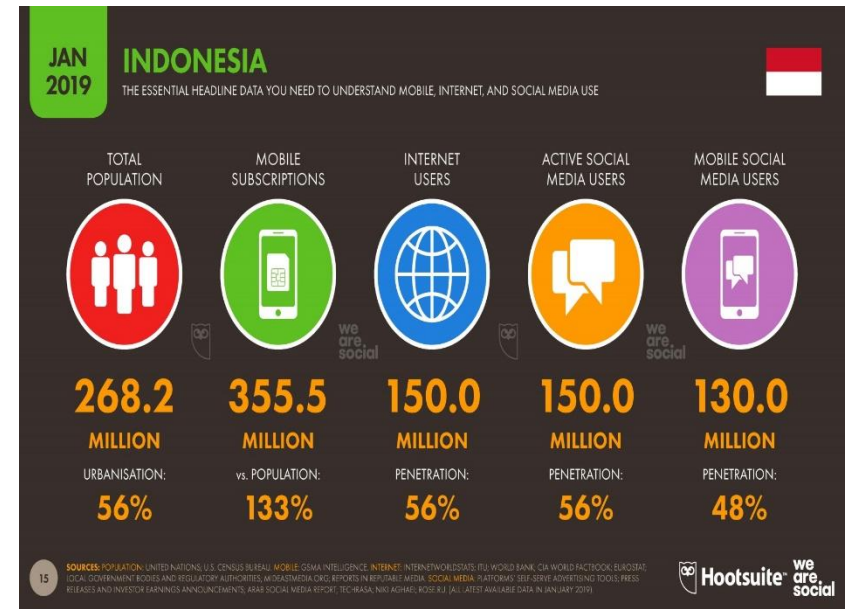
Figure 1 . Data from internet and social media users in Indonesia on Jan 2019. This Figure was adopted from https://websindo.com/indonesia-digital-2019-tinjauan-umum, on December 5, 2019

The development of technology and information is marked by the entry of the internet in human life that makes a significant change. With the development of technology, it makes many application platforms appear including social media. Social media are experiencing a rapid development. Therefore, social media is often used by businessman as a tool to promote their products (see Figure 1).